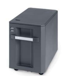
3,000-SHEET PAPER FEEDER PF-770 Ideal for large print runs in A4.